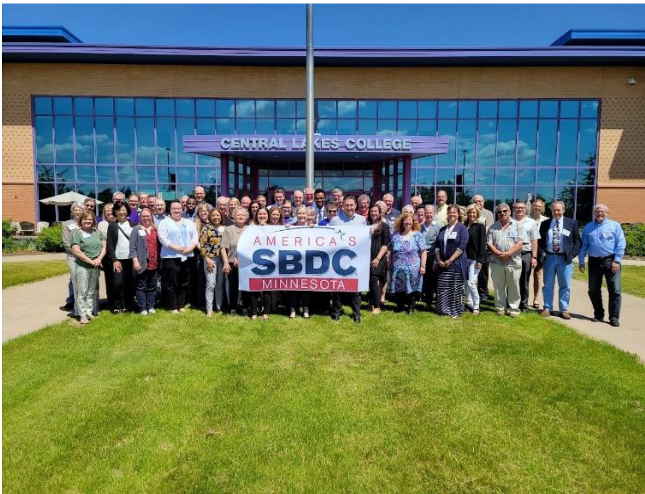
2022 MN SBDC Knowledge Exchange Program Conference, Central Lakes College, Brainerd